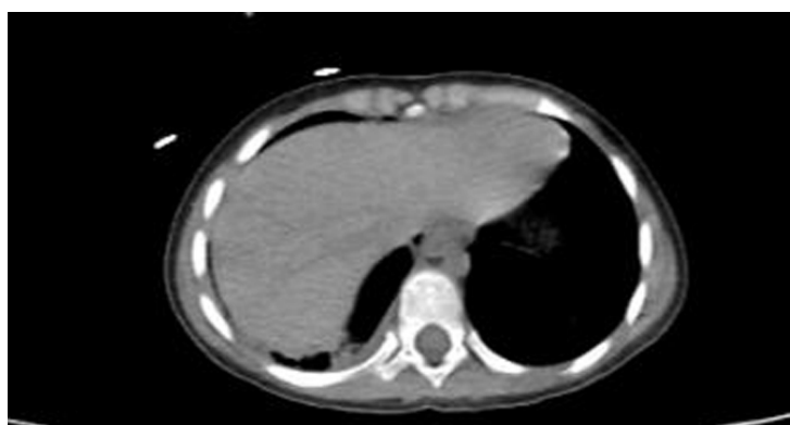
Fig. 4. Thoracic CT scan in the axial plane showing sub-phrenic free air

The patient was visited by a pediatric infectious disease specialist, and the COVID-19 treatment protocol started under the supervision of a pediatrician. During inspection of Chest CT scan and in the lower sections of the lung CT scan, we noticed free air in the abdomen and below the diaphragm in favor of pneumoperitoneum (Figure 4).