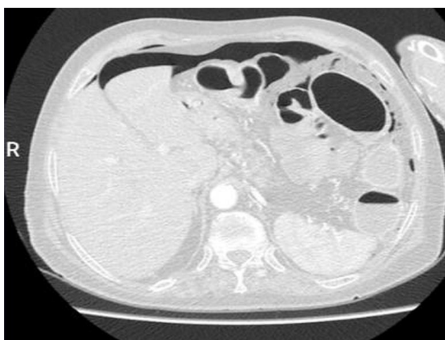
Fig. 2. Thoracic CT scan in the axial plane, showing sub-phrenic free air

taking ECG and visit by an internal medicine physician, we decided to perform exploratory laparotomy to find the source of pneumoperitoneum. In this way, after pre-operative preparations, the patient was transferred to the operating room.