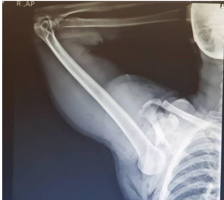
Fig. 2. Pre-reduction radiography indicated inferior glenohumeral dislocation