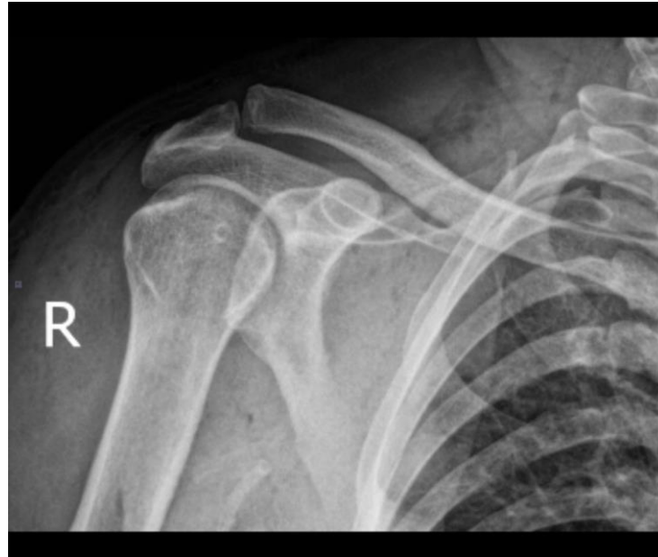
Fig. 4. Post-reduction radiograph showing a concentric reduction of the shoulder joint