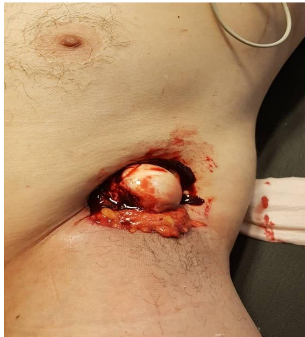
Fig. 1. Clinical photography of patients with open luxatio erecta humeri dislocation and exposure of the humeral head in the axillary site

inferior capsule. After reduction, tendon and capsule were repaired by ethibond excel nonabsorbable polyester. CT angiography was also conducted to make sure of the intact blood circulation and lack of intimal tear (Fig. 5). The patient was hospitalized for 3 days and treated with antibiotics. After vascular examination, he was discharged from the hospital. In the 4-week follow-up, the movement was carried out in adduction and internal rotation and post-operative antibiotic therapy continued for three days. Customized dynamic splinting was used for the wrist due to radial nerve palsy. The patient's movement started 4 weeks after the surgery which exhibited complete stability. 4-month follow-up indicated that the radial and ulnar nerves paralysis resolved and the normal function was retained. In the follow-up period based on MRI findings, there was a massive rotator cuff tear in the supraspinatus and infraspinatus tendons and they needed a secondary reconstruction.