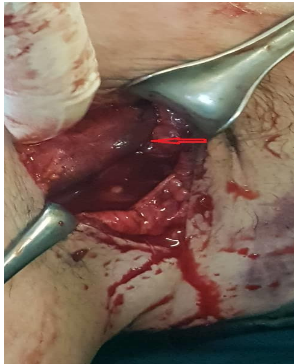
Fig. 3. Clinical photography after open reduction and releasing the brachial artery (The arrow represents the artery)