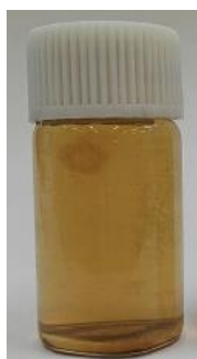
Fig (2). The aqueous extract of Rheum turkestanicum

The shoots part of Rheum turkestanicum (3.0 g) were put to be dried and powdered; then they were extracted with maceration in distilled water for 24 hours. After being filtered, the crude extract was preserved in the refrigerator (Fig. 2).