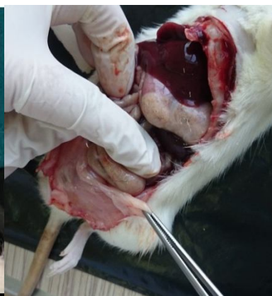
Fig.2. Score 1 adhesion