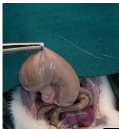
Fig.1. Score 0 adhesion

The Zühlke scores were significantly lower in the silymarin (median=1) and vehicle (median=2) groups compared to the control group (median=3.5); P = 0.005 , (Figure 5). There were 3 animals in the control group with a Zühlke grade 4 score whilst the other groups had no animals with a grade 4 score. Three animals in the silymarin group had grade 1 and the others had grade 2 scores. Three animals in the vehicle group had grade 3, two animals had grade 2 and one of them had grade 1 score (Figure 6).