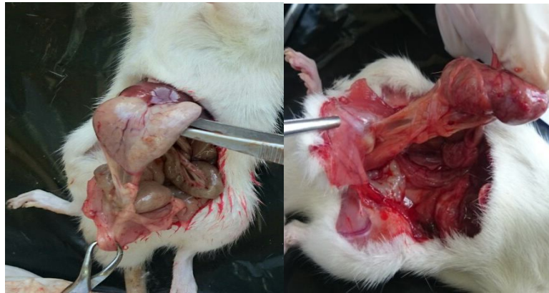
Fig 3: Score 2 adhesion